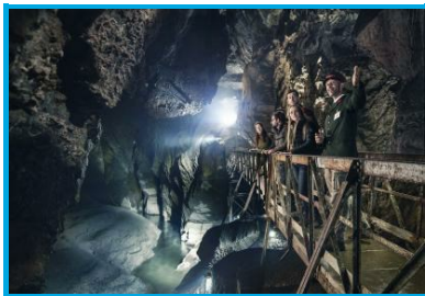
Domaine des Grottes de Han