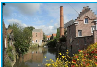
Moulins d'Arenberg