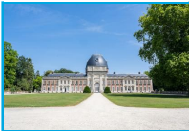
Le Brabant wallon