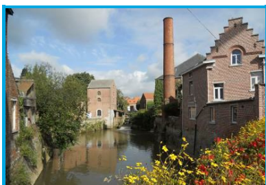
Moulins d'Arenberg