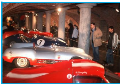
Abbaye de Stavelot