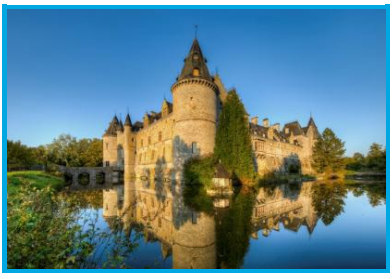
WBT - Vincent Ferooz