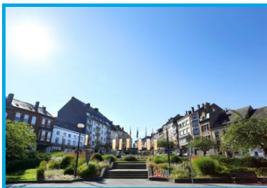
CGT - Arnaud Siquet