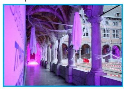
Province de Liège Musée de la Vie wallonne

Event planned for the month of October 2024