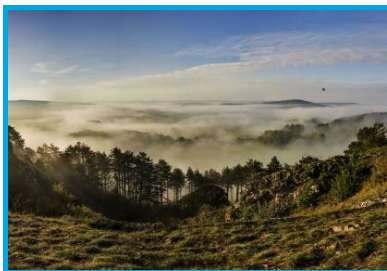
Geopark Famenne Ardenne