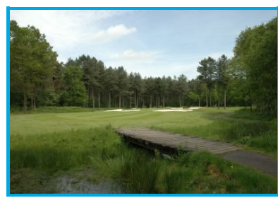
Royal Golf Club du Hainaut