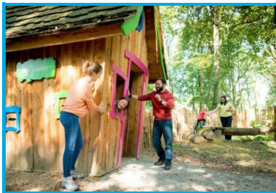
Maison du Tourisme de la Wallonie picarde