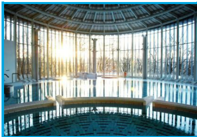
Thermes de Spa