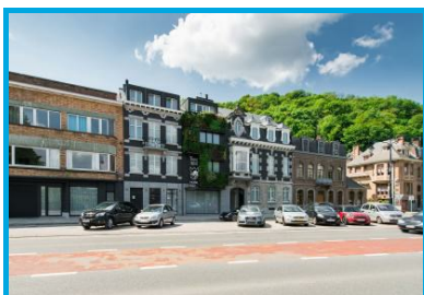
The Royal Snail