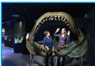
Aquarium-Muséum de Liège