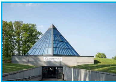
Office du Tourisme de Comines-Warneton