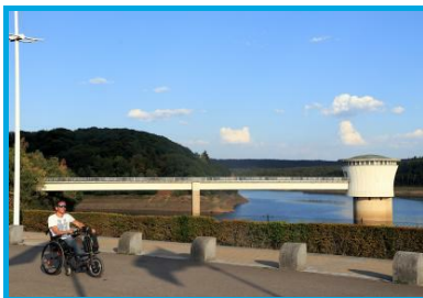
WBT - Arnaud de Coster