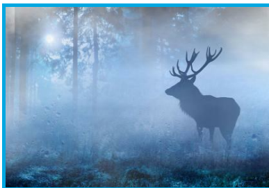
Domaine des Grottes de Han